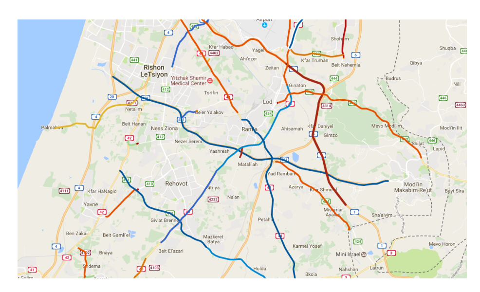
Fig. 2: A snapshot from SafeRoad.today system. Risk illustration is as follows: Red = "Very High", Orange = "High", Azure = "Low" and Dark Blue = "Very Low". Average risks are not depicted.

A snapshot of our system is provided in Figure 2.