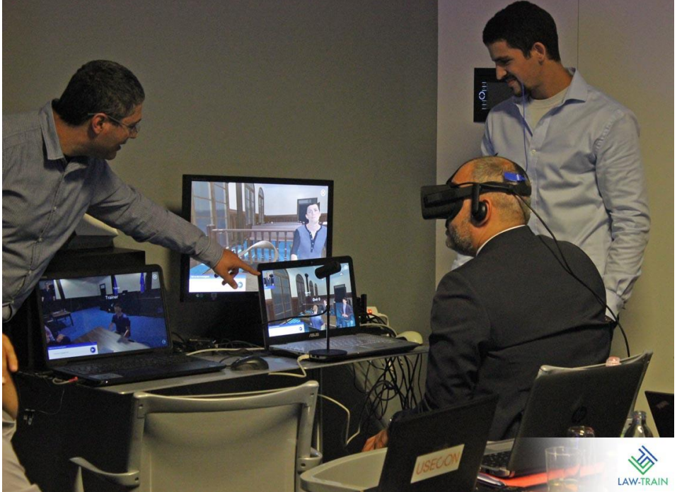
Caption: The 3D virtual environments could be experienced through Augmented Virtual Reality Glasses. This latest version of the 3D environments was presented by the technical partner Compedia.